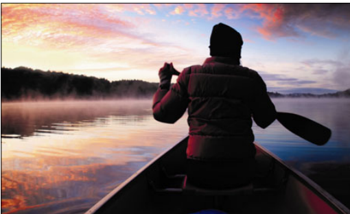
"Prescription Strength" — A hilarious and poignant satire about a current day issue affecting us all... (no spoilers!) revealed in the perfect post-modern capsule, a prescription drug commercial.