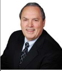
By JIM SMITH , Realtor®

Two other metro counties showed slight increases, although the percentage for the entire MLS showed