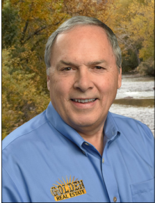
By JIM SMITH , Realtor®

What makes a home hard to sell in "normal" times? Traffic noise: That is the single biggest complaint I get from buyers when I'm showing homes. People do not want to hear road noise when they're on their porch or patio or when they have their home windows open.