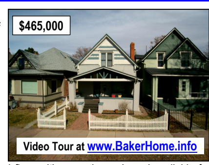
Video Tour at www.BakerHome.info

Here's your opportunity to buy an 1890 Victorian home in the diverse and booming Baker Historic District of Denver. As of this writing there are no single family homes for sale in Baker! This home at 169 W. Maple Ave. has 1,404 sq. ft., 3 bedrooms, and 2 bathrooms on a 3,050 sq. ft. lot. The main floor features a bedroom, the living room, full bathroom, dining room, kitchen and, at the back of the house, a heated sunroom. The upper floor has two more bedrooms and a bathroom. There is a small backyard and a one-car garage off of the back alley. Major updates include professionally engineered support system for the floor joists, and a new furnace in 2013. This is an old house in need of some updating, but it has lots of character and you'll love the hardwood floors. It's move-in ready and available for quick possession. Call your agent or Chuck Brown at 303-855-7855 for a private showing. Be sure to watch the narrated video tour with drone footage at the website above. Open house this Saturday, March 11th, 1-3 p.m.