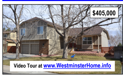
Video Tour at www.WestminsterHome.info

This immaculate 2,313-sq-ft, 3-bedroom plus a loft, 3-bathroom home is at 10020 Nelson Street , just north of scenic Standley Lake. It has been remodeled top to bottom, including a new roof. The home features hardwood floors, custom tile, trim, railings and doors. The unfinished basement gives you the flexibility to pick your finishing touches to create a perfect space. Relax on the covered patio after a long day in your private, landscaped yard and enjoy the peace of this quiet neighborhood. Hurry to schedule a showing, this one will go fast! Take a narrated video tour, including drone footage, at the website above, then call your agent or Kristi at 303 525-2520 .