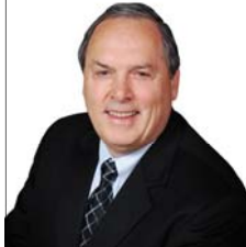
By JIM SMITH, Realtor®

Another important tool is a device to detect moisture within walls. If you can see water stains on a wall or ceiling, this device can tell the inspector whether there is moisture beneath the surface. If no moisture is detected, you'll still want to get an explanation of the stains.